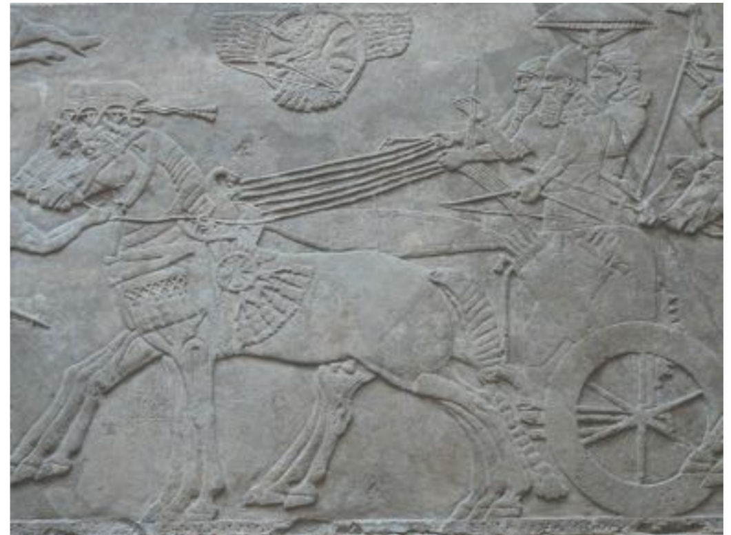
Winged god Ashur accompanying king into battle