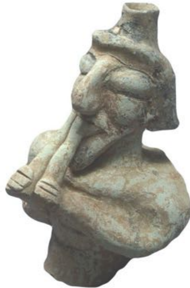
Terra Cotta Flute Player